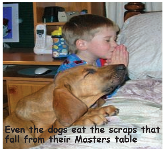
Even the dogs eat the scraps that fall from their Masters table