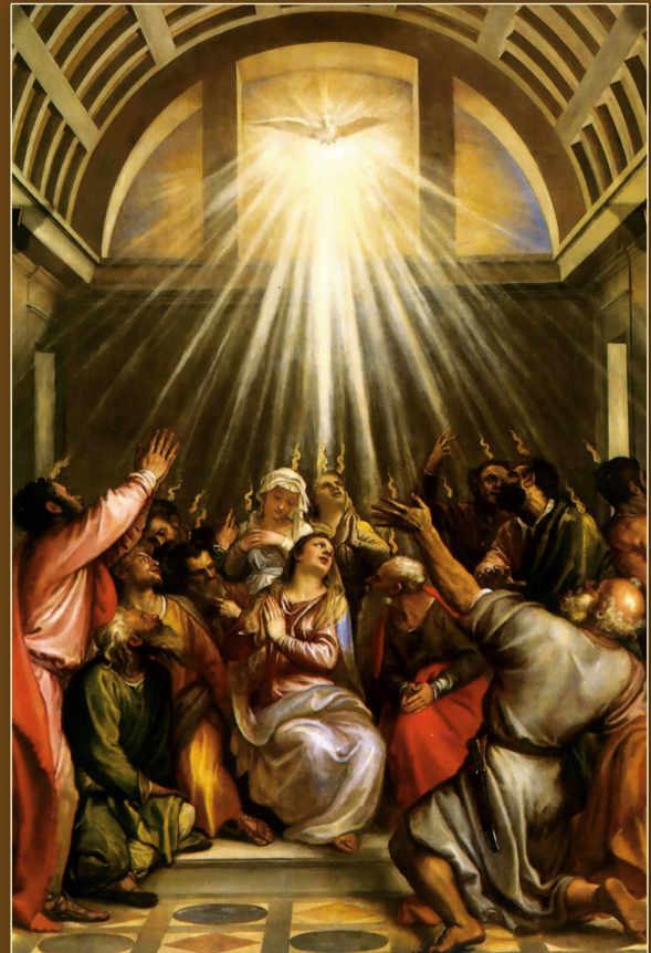
They were all filled with the Holy Spirit and began to speak in different tongues, as the Spirit enabled them to proclaim.